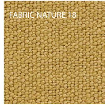
FABRIC NATURE 18