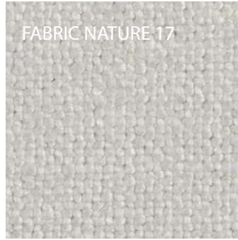
FABRIC NATURE 17