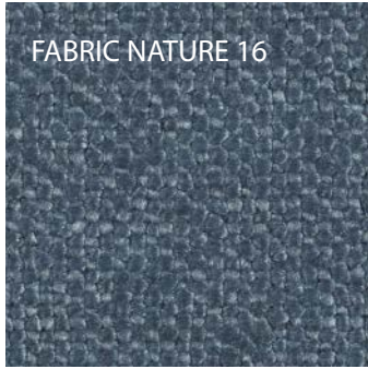
FABRIC NATURE 16