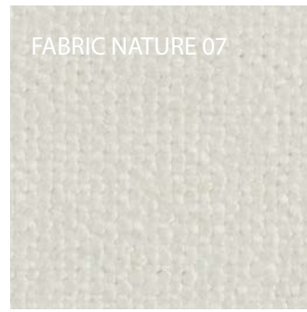
FABRIC NATURE 07