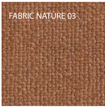
FABRIC NATURE 03