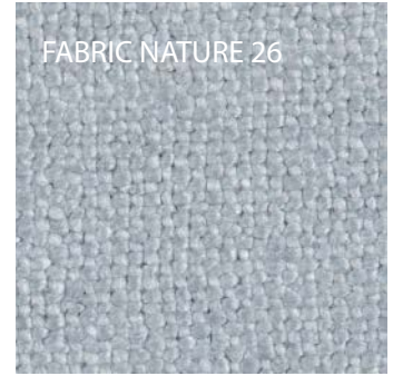
FABRIC NATURE 26