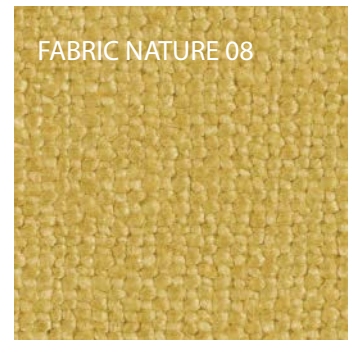
FABRIC NATURE 08